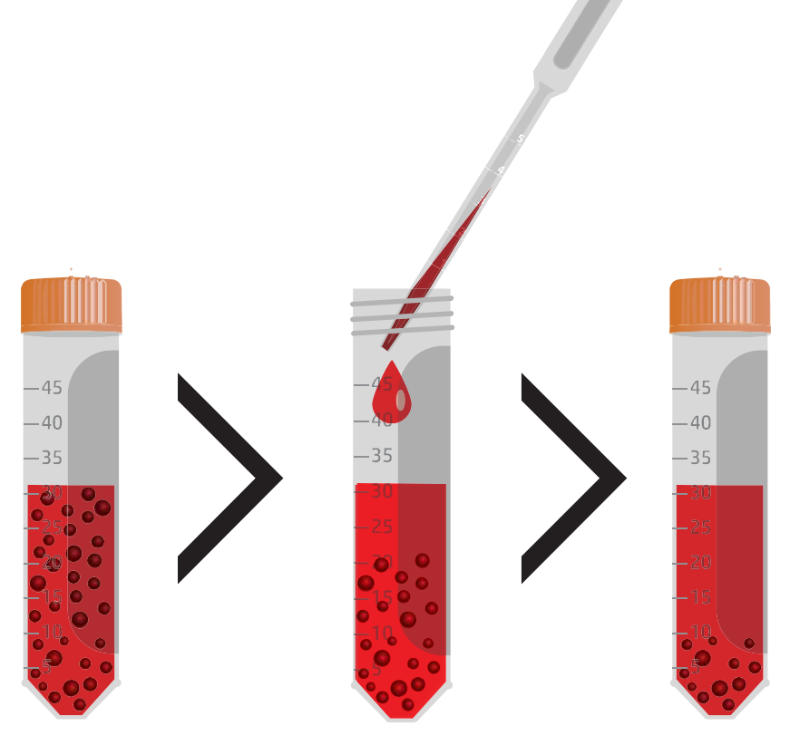
Figure 3. Harvesting cellular material using Happy Cell® ASM Inactivation Solution.

If you wish to collect a pellet for protein or nucleic acid analysis, cells should be treated with Happy Cell<sup>®</sup> ASM Inactivation Solution while in the bioreactors (Figure 3). Use the Inactivation Solution as recommended but add a centrifugation step prior to media aspiration to ensure a compact pellet.